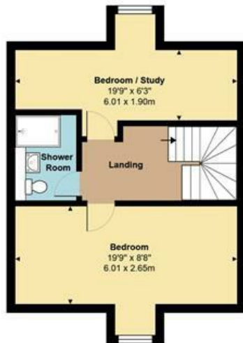
Second Floor Area: 466 ft 2 ... 43.3 m 2